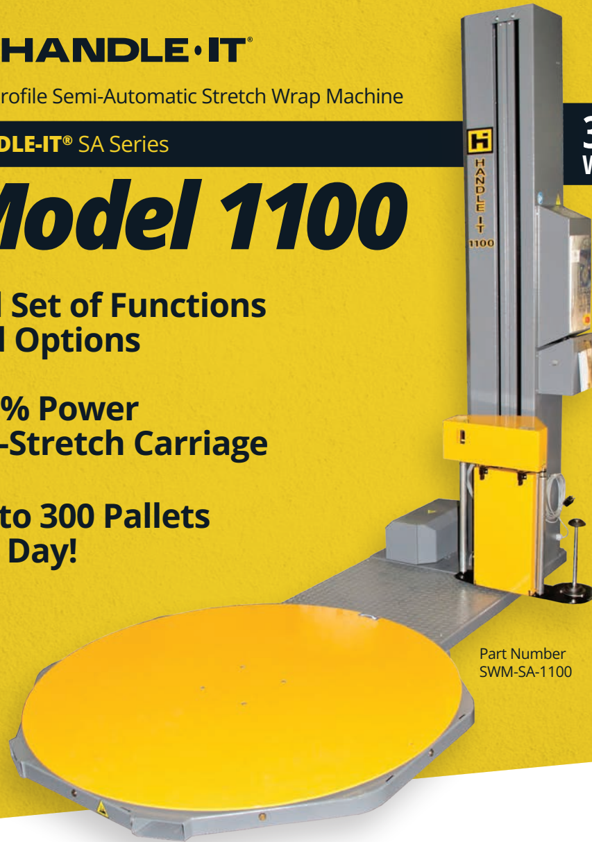
Part Number SWM-SA-1100