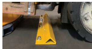
Forklift Wheel Stop