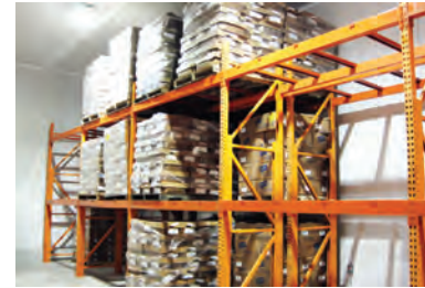
Double Deep Rack