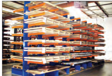
Cantilever For Long Objects