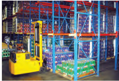
Drive-In Rack For Dense Storage