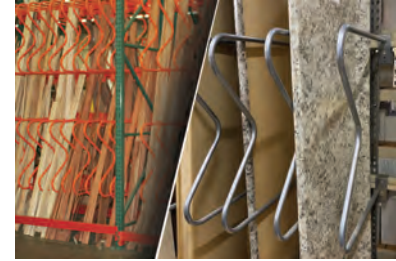
"M" Dividers For Vertical Storage