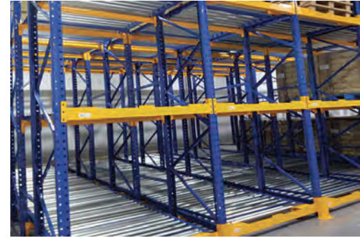
First-In First-Out (FIFO) Rack System