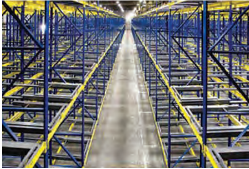
Push-Back Rack Design