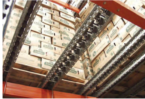
Pallet Flow System